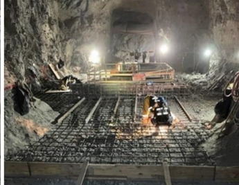
Grizzly installation and truck ore loading pocket foundation pours

Regional drilling program commences: One reverse circulation drill is planned to be on site starting the week of October 2, 2023. The primary goal of the 5,000-foot drill program is to follow-up on the recent results and historic sampling that are discussed in the Nevada Copper news release dated July 26, 2023. The Copper Ridge and Dimples target areas are outside of the current mineral resources and have the potential to establish additional mineral resources within the Pumpkin Hollow property.