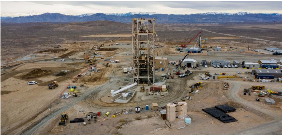
January 15, Site Construction Progress including East Main Headframe