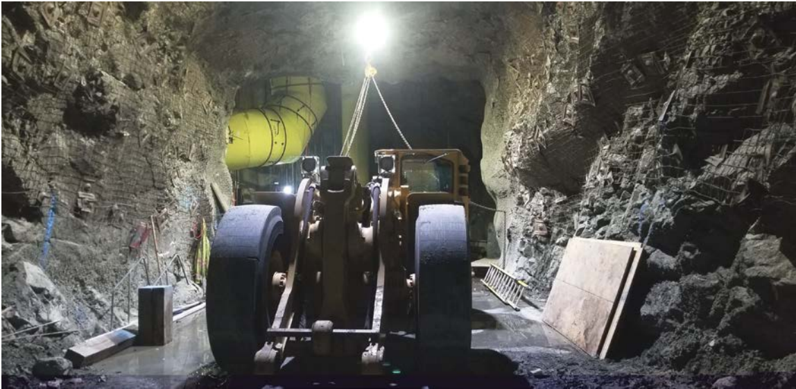
Caterpillar R1600 Loader being installed on the 2850 Shaft Station