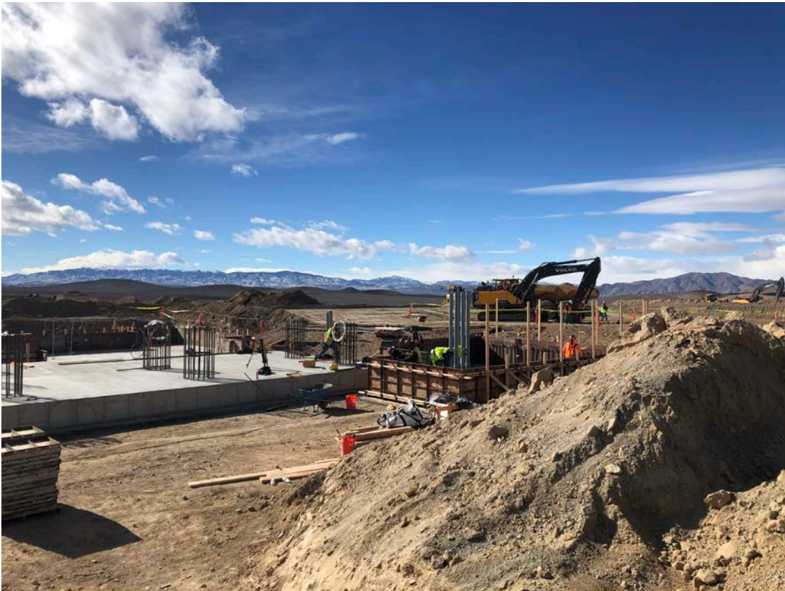
Sag/Ball/Verti Mills and Cyclone Foundations well Advanced